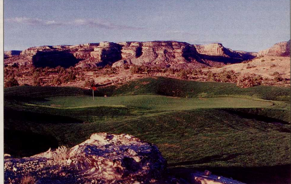
The third hole at the Golf Club at Redlands Mesa

The layout is testament to Engh's ability to work with difficult sites. The routing takes advantage of the natural surroundings, resulting in a course that blends well with the land. Typical of Engh's work here is the 17th hole, a 240-yard par-3. Lying more than 130 feet below the tees, the large green is snugged into a natural rock amphitheater.