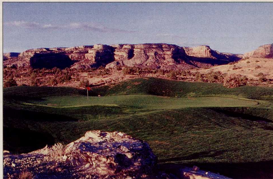
The third hole at the Golf Club at Redlands Mesa

The layout is testament to Engh's ability to work with difficult sites. The routing takes advantage of the natural surroundings, resulting in a course that blends well with the land. Typical of Engh's work here is the 17th hole, a 240-yard par-3. Lying more than 130 feet below the tees, the large green is snuggled into a natural rock amphitheater.