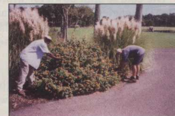
Maintenance workers tend to one of the many flower beds at Sea Marsh

Cregan has been adding flower beds to both the Sea Marsh layout and the Ocean Course, which