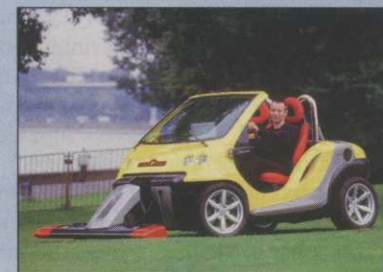
The "Zero" will be marketed worldwide.