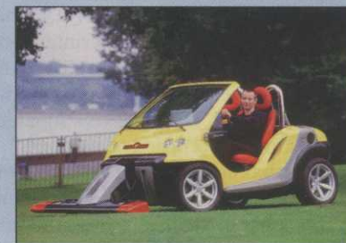
The "Zero" will be marketed worldwide.