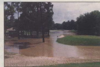
Tropical Storm Allison left a mess at the Northgate CC in Houston.

The phenomenon of El Nino and La Nina effect rainfall pat-