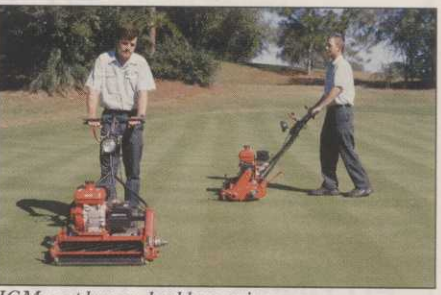
IGM employees doublemowing a green

is on the properties every two weeks. If something pops up like some unfamiliar turf disease, there are digital cameras at every site. Superintendents can take an image of a problem and submit it to the office so that a group of experienced people can evaluate it. That way we can diagnose or dispatch someone to visit the course immedi-