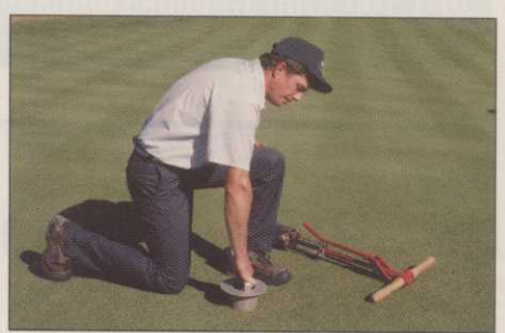
Hole placement by an IGM staff member

Zakany: We're working with various colleges and universities on intern development programs. We're striving to involve