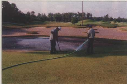
Hoses and squeegees were required to remove layers of silt from greens at the Northgate CC.

especially mole crickets - on the course all summer that got washed in with the silt and infested areas covered by the flooding," said Dayton. "We used MSMA [herbicide] to help control the crabgrass and goosegrass. All we could do was keep trying to suppress them."