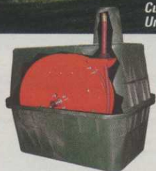
Cut-away of Reelcraft's Underground DGM Syringing System.