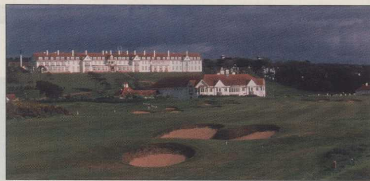
The 18th hole at the new Kintyre Course at the Westin Turnberry Resort