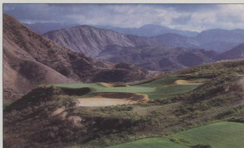
Pete Dye's Lost Canyons Golf Club outside of Los Angeles is one of the 19 new public tracks to open in California this year. The 17th hole is pictured above.