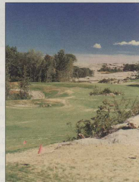
Nine holes at Quarry Hills will open in spring

QUINCY, Mass. — Seeding was completed this fall on the first nine holes of Quarry Hills, the 27-hole course being built atop the Quincy and Milton landfills a mere six miles from downtown Boston. The course is using fill material from the capital city's massive "Big Dig" highway