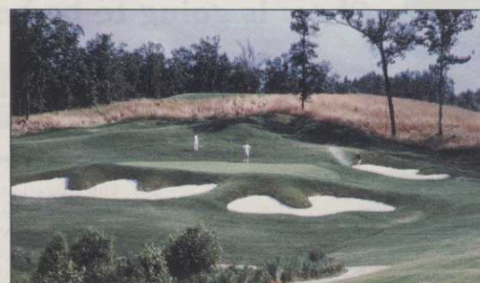
Third hole at Mallard Pointe Golf Course, in Sardis, Miss.