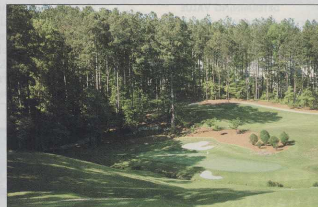
View of the 17th hole at White Columns