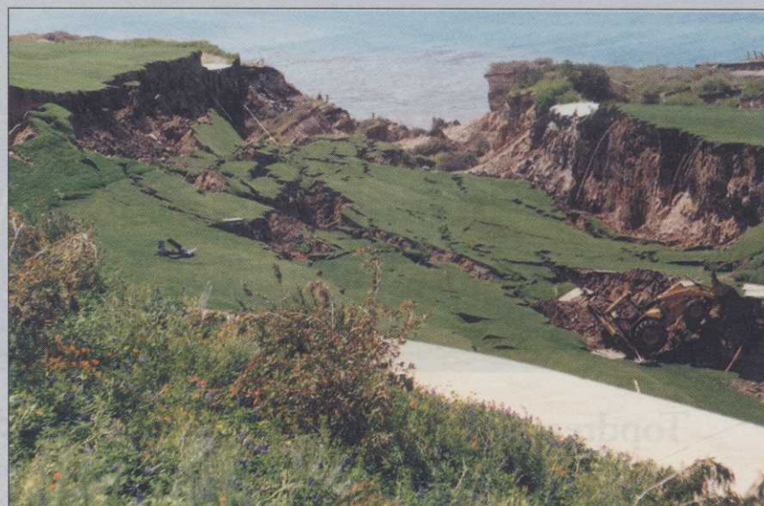
The 18th hole at Ocean Trails after the big slide. Repairs cost $35 million.