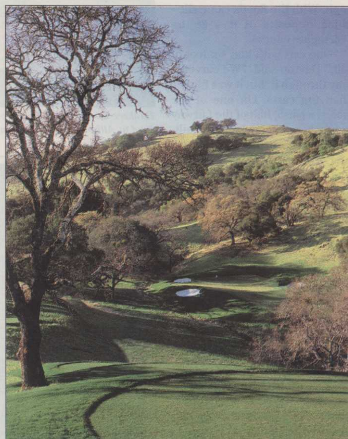
The fifth hole at Mayacama Golf Club, north of San Francisco

Final permit approvals were secured when the new plans toned down the development aspects for the site. Steering the project towards a private club — with little addition of roads and