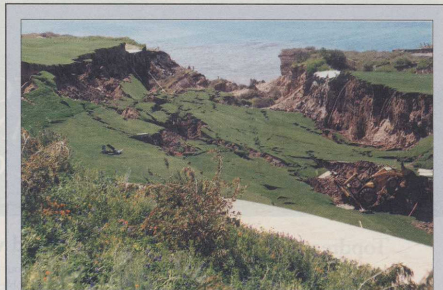
The 18th hole at Ocean Trails after the big slide. Repairs cost $35 million.