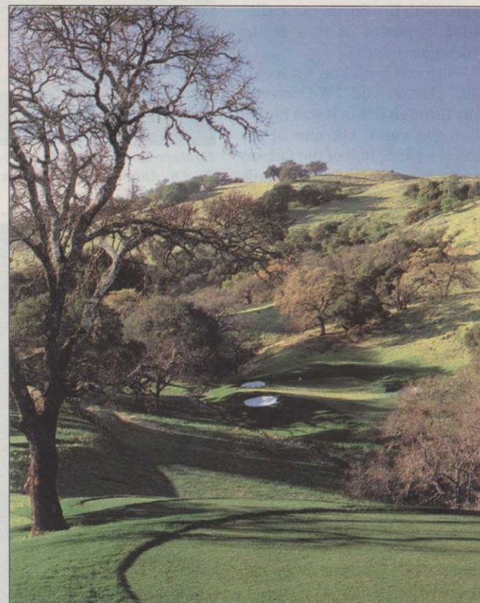
The fifth hole at Mayacama Golf Club, north of San Francisco

Final permit approvals were secured when the new plans toned down the development aspects for the site. Steering the project towards a private club — with little addition of roads and