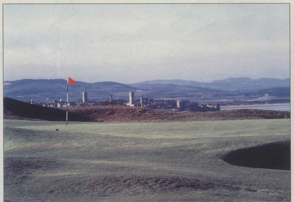
The 13th hole at the Torrance Course at St. Andrews Bay, with St. Andrews in the distance.