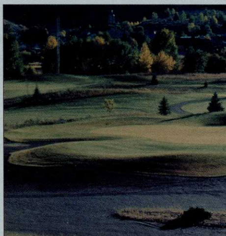
The seventh hole at Old Works GC in Montana will be replicated at Bear's Best Las Vegas.