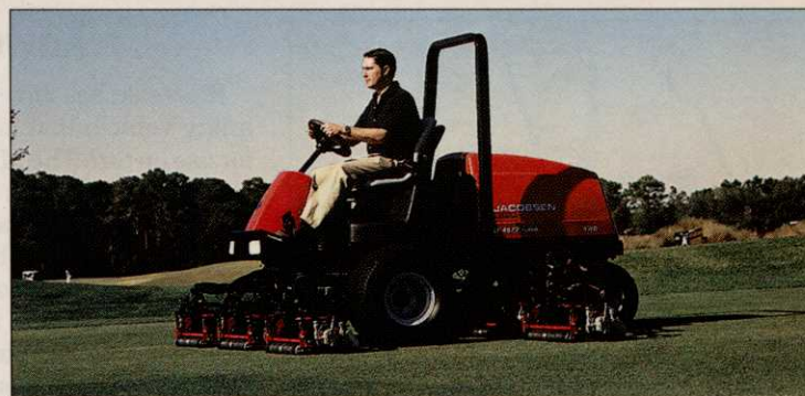
The Jacobsen LF-4677 seven-gang mower in action

For more information, contact 888-922-TURF.