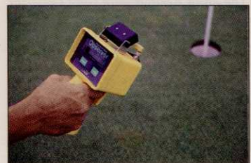
Spectrum's Chlorophyll Meter

The device, which utilizes patented NASA technology, has high-powered lasers that outline the edges of a measured sample