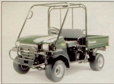
Kawasaki's new Mule 3020

For more information, contact 949-770-0400 or www.kawasaki.com .