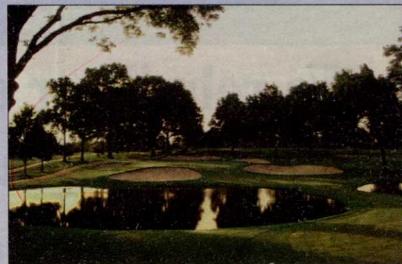
The 13th hole at Southern Hills Country Club

The Open is back at Southern Hills after a 42-year hiatus. In 1958, playing in sweltering heat, club-throwing Tommy Bolt won his only Open title here, besting a young South African named Gary Player by four strokes. Bolt's skillful use of his driver on Southern Hills' tree-lined fairways, fringed by gnarly and deep rough, was the deciding factor.