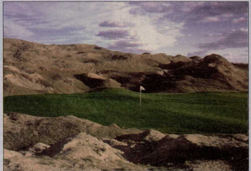
The 13th hole - "Blind Man's Bluff" - at Whistling Straits' Irish Course, which opened Aug. 1

NATIONAL® is a Registered Trademark of National Mower Company