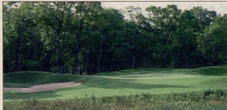
The 17th hole at the Arthur Hills-designed Sienna Plantation GC, near Houston