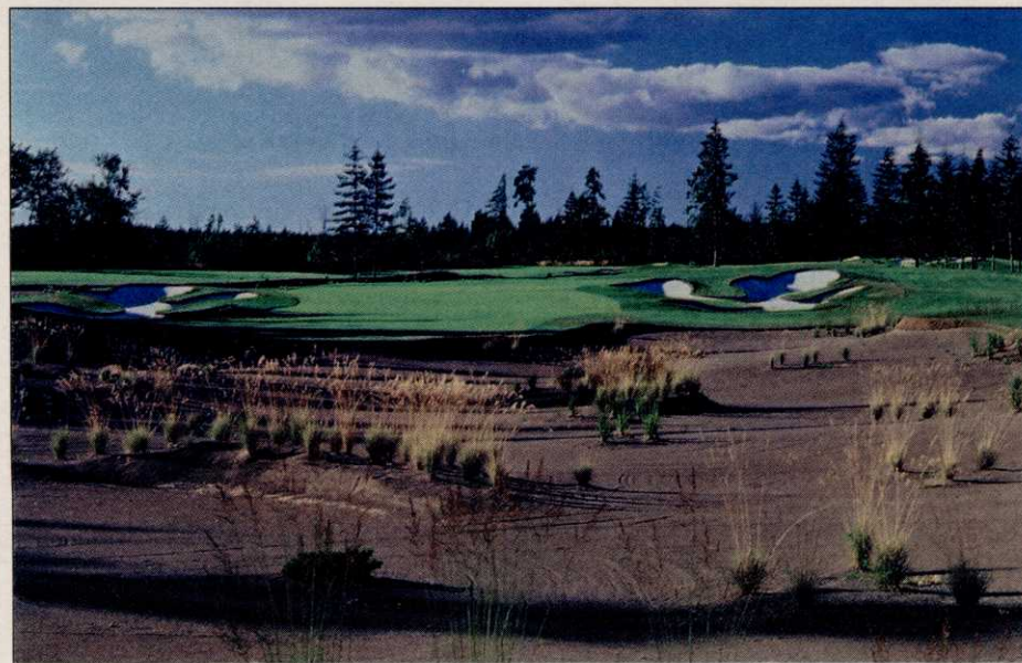
The 8th hole at the newly opened Washington National Golf Club

The University Course features five sets of strategically placed ryegrass tees, allowing golfers of all skill levels to play the course, which ranges from 7,304 yards from the back pegs down to 5,117 yards from the shortest markers. A large club-