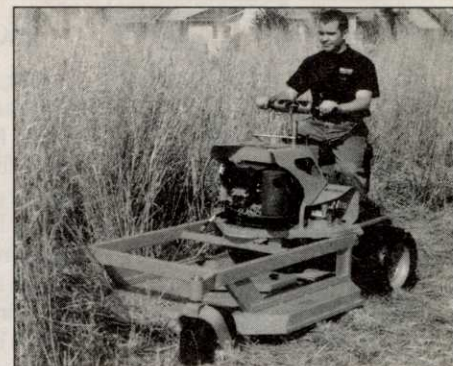
The 48-inch, zero-discharge Hustler Hog and a backward twist for reverse. For more information, contact 1-800-395-4757.

Excel Industries introduces the Hustler Hog, a mower ideally suited for places that are mown only once or twice a year. The Hog features a 48-inch single-blade deck that can cut anything it can bend over. The zero-discharge deck is constructed for extra heavy-duty operation and has reinforced side walls. The 5/16-inch-thick blade has swinging blade tips for added safety and a hazard-jumper center section. The Hog also features H-Bar Steering. This easy-to-operate concept resembles motorcycle steering, with a forward twist to move forward