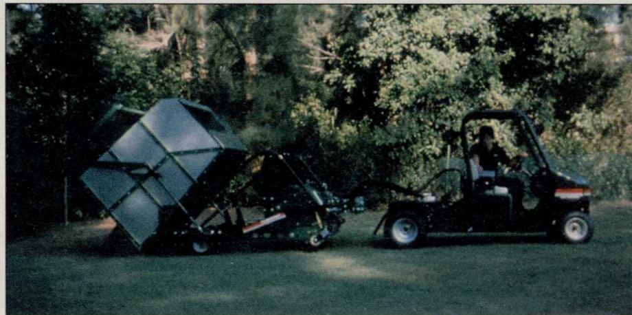
The Cushman 705 sweeper