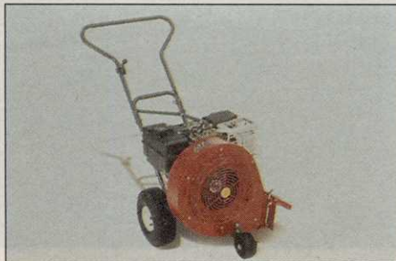
The MTD F8 Tornado

The F8 Tornado blower from MTD Pro is powered by an 8-hp Briggs and Stratton Industrial Plus engine which generates 175 mph air speed and 2500 CFM air volume. The Tornado also offers the following features: impeller blades cast from heat-treated, aviation-grade magnesium, a built-in deflector, and 11-inch by four-inch pneumatic tires for easy rolling. The blower meets OSHA Noise-Level Requirements. For