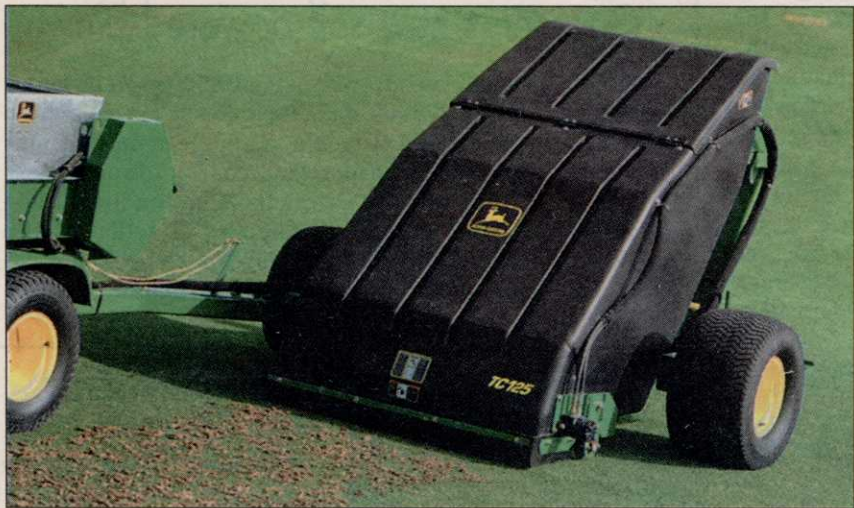
John Deere's TC125 turf collection system