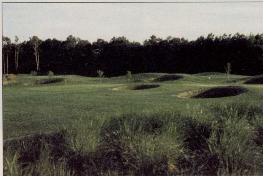
The TSC Golf-managed Wicked Stick Golf Club in Myrtle Beach, S.C.