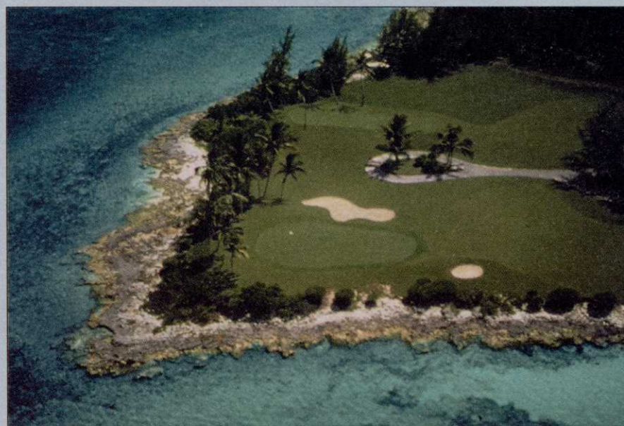
The Ocean Course plays along the cerulean waters of the Atlantic Ocean and Nassau Harbour.