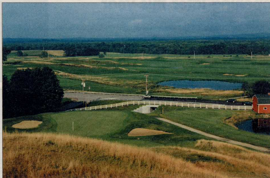
The outlook from the 17th fairway affords views of the 17th green and the links layout of the front nine.

Designed with 11 holes of rolling mounds, fescue grass, and strategically