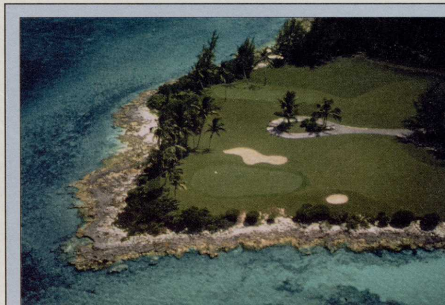
The Ocean Course plays along the cerulean waters of the Atlantic Ocean and Nassau Harbour.