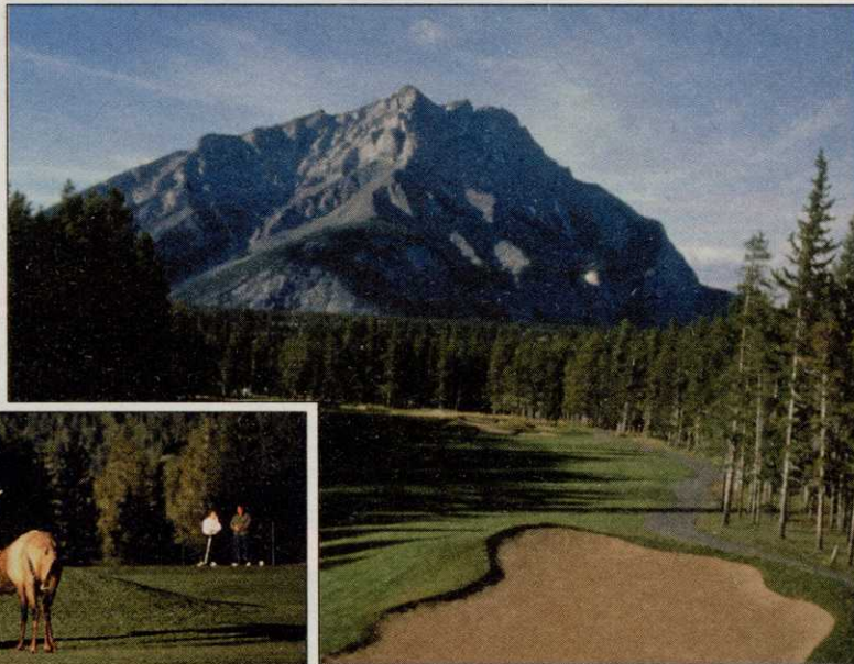
Banff Spring GC has dramatic mountain setting, but also an abundant number of troublesome elk

them up. This is what they do to prepare for rutting [mating] action. Unfortunately, they like to do this on the greens, and when they're done, it looks as though someone has literally roto-tilled an area