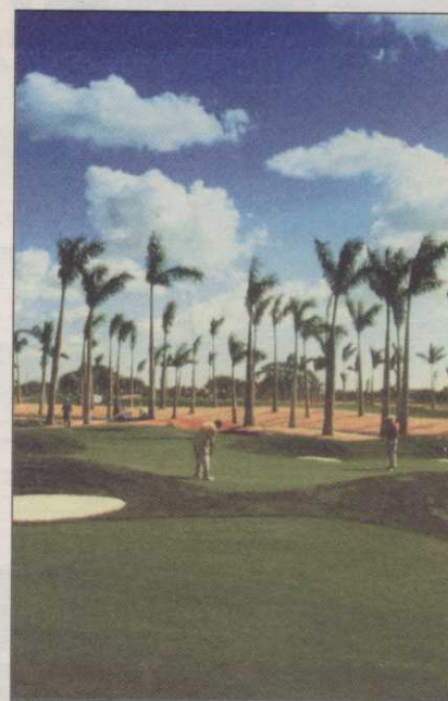
KSL-operated Doral Golf Resort.

KSL also owns KSL Fairways, which owns and operates 28 golf facilities