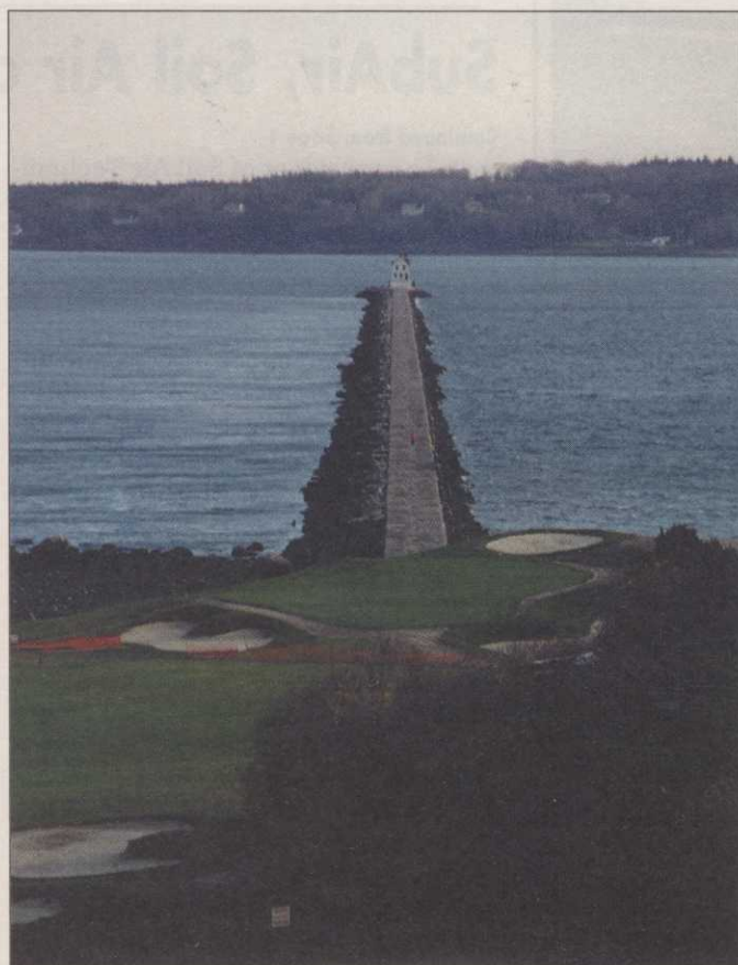
The new 4th hole at Samoset Golf Club runs down to the Atlantic Ocean, nearly meeting the resort's famous breakwater.