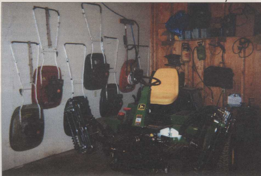
A lift for heavy equipment is a crucial part of the maintenance complex at Country Club of Charleston.

Then came turfgrass studies at the University of New Hampshire and then at University of Massachusetts' Stockbridge School, where he earned a winter school degree in 1987 and continuing education units in the winter of 1990.