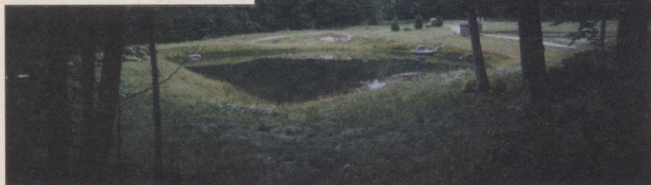
Winter work reaps fine summer results at Claremont Country Club.