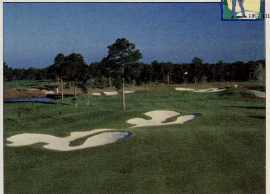
The Robert Trent Jones Jr.-designed Raven Golf Club at Sandestin offers Mackenzie-esque challenge