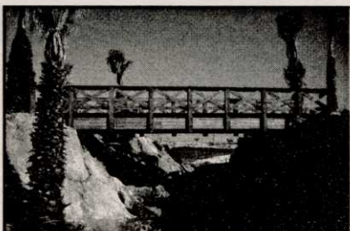
The Macho Combo: Combines the beauty of wood and the strength of maintenance free self-weathering steel. Bridge designed by Golf Dimensions.

Specializing in golf course/ park/ bike trail bridges and using a variety of materials to suit your particular landscape needs, we fabricate easy-to-install, pre-engineered spans and deliver them anywhere in North America.