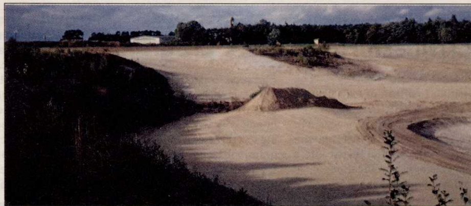
Berlin Golf Club Gatow.