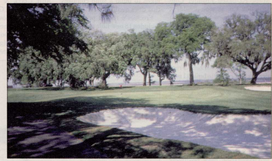
Winyah Bay Golf Club ssouth of Myrtle Beach is receiving international acclaim.