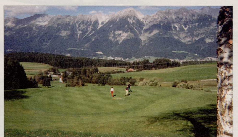
Austria's venerable Innsbruck-Igls Golf Club faces major renovations.