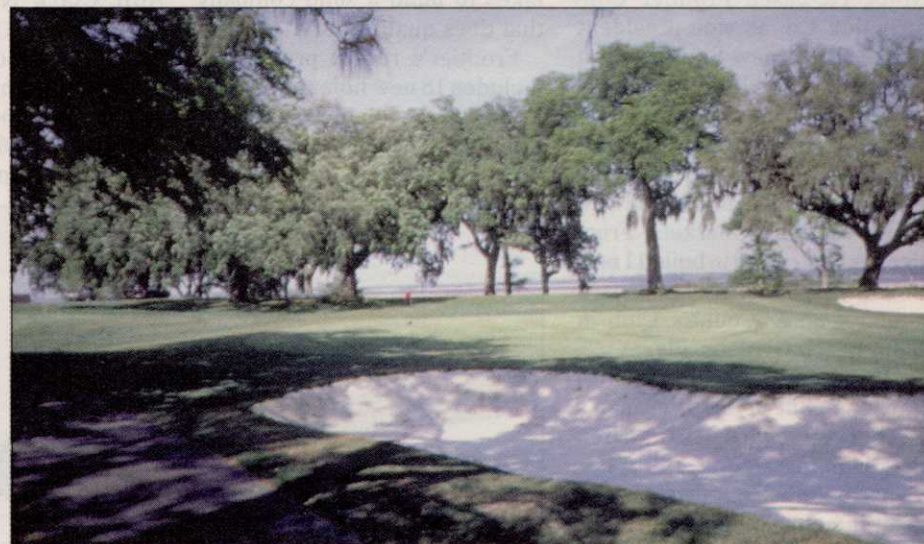
Winyah Bay Golf Club south of Myrtle Beach is receiving international acclaim.