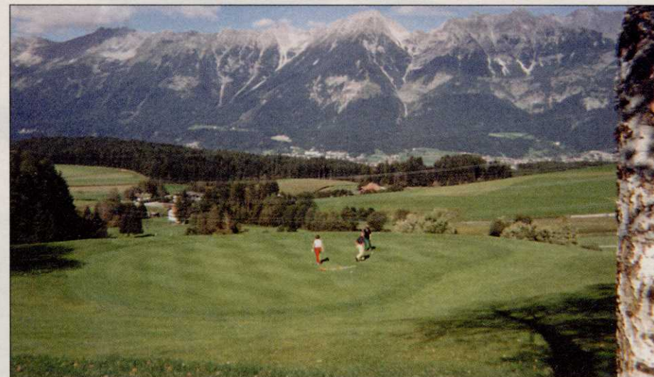
Austria's venerable Innsbruck-Igls Golf Club faces major renovations.