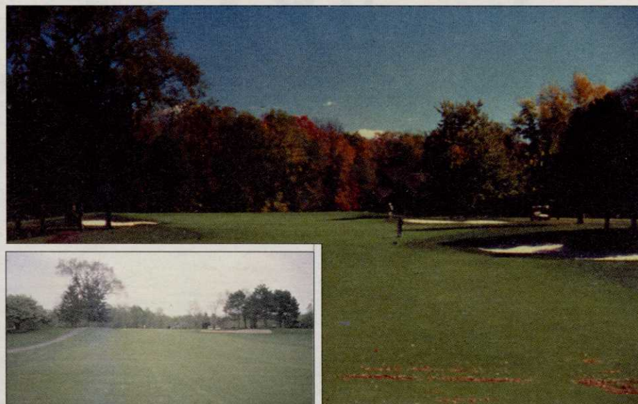
The 15th hole at Grosse Ile Golf & Country Club, before (inset) and after renovation.