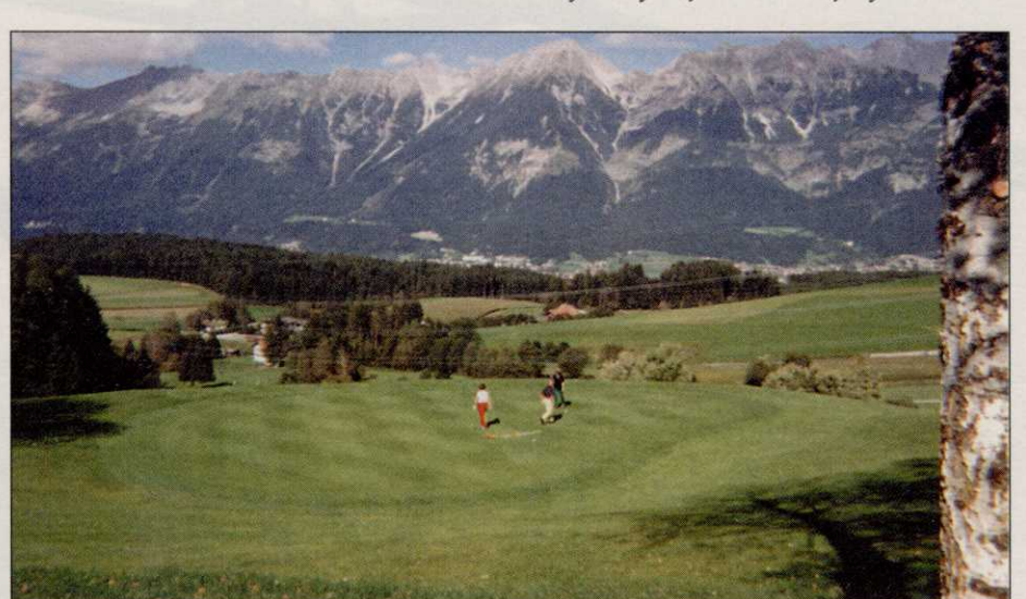
Austria's venerable Innsbruck-Igls Golf Club faces major renovations.