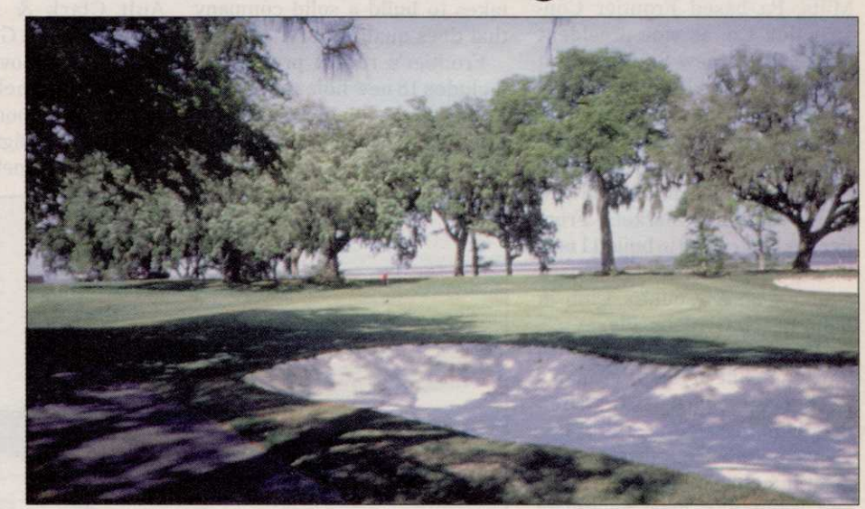
Winyah Bay Golf Club ssouth of Myrtle Beach is receiving international acclaim.