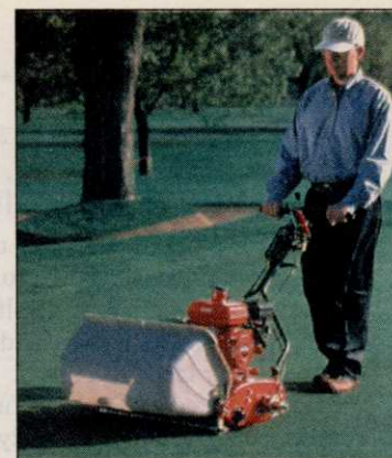
The Jacobsen PGM 19.

For more information, contact 888 922-TURF.