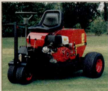
The Verti-Drain 7007.