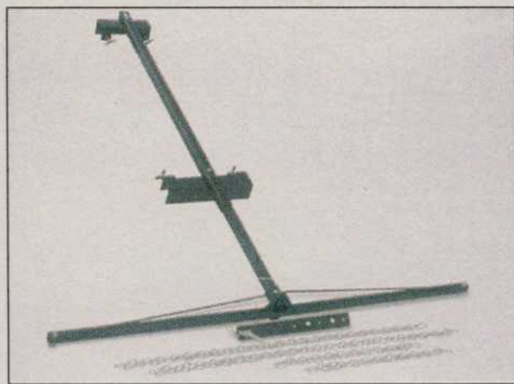
Standard Golf's drag brush transport unit.