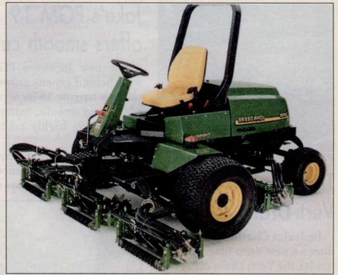
John Deere's lightweight 3215B fairway mower.

For more information, contact John Deere Inquiry Department, PO Box 12217, Research Triangle Park, NC 27709.