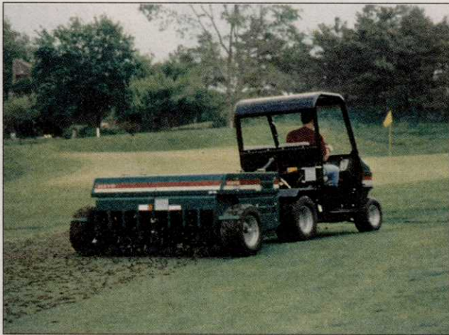
The Ryan GA-60 aerator makes tracks.

For more information, contact 888-922-TURF.