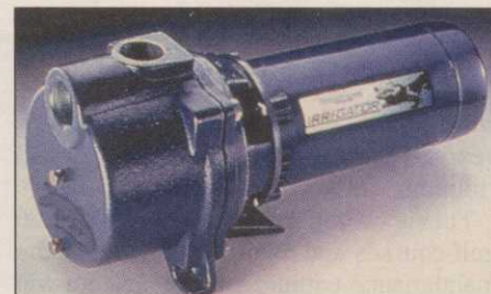
The GT IRRI-GATOR.

PHC BioPak Plus is available in 1-pound or 5-pound bags and a 1-pound jar with a pre-measured spoon for easy application. For more information, contact 800-421-9051.