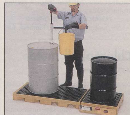
Prevent spills with SpillDecks.