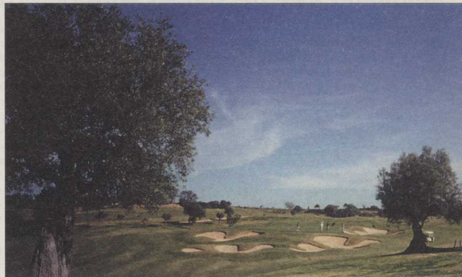
Carvoeiro Golf Club in Portugal is "Committed to Green."