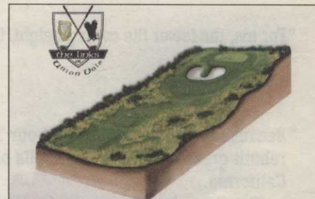
The 7th hole at The Links at Union Vale.