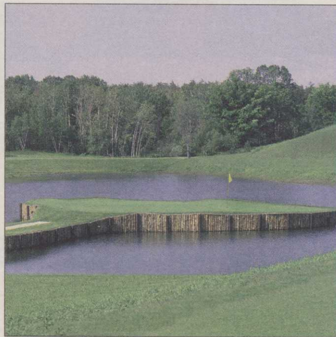
The 17th hole at Wooden Sticks.