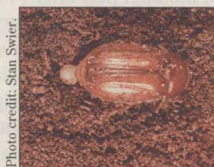
European chafer depositing eggs.