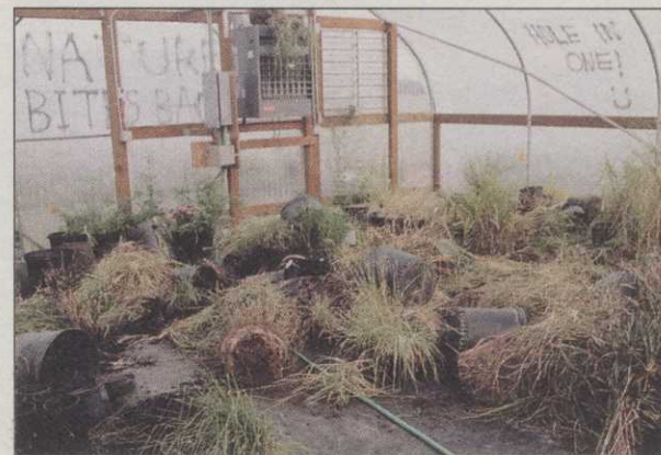
Damage to Pure Seed's experimental grass plots.

The vandals stole onto the 110-acre research farm