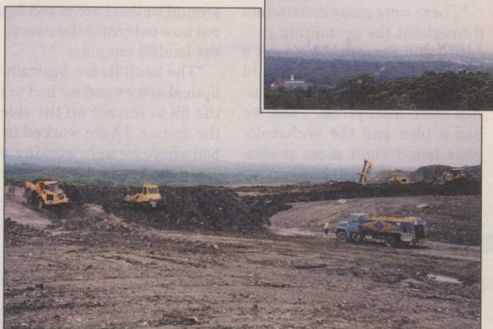
It took an average of 800 trucks a day for three years to bring 7.7 million cubic yards of fill from the Big Dig to Quarry Hills. A view of the Boston skyline from the site. (inset)