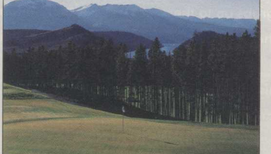
Keystone's back nine provides breathtaking views.

6,886 yards, with a rating of 70.3 and a 131 slope. The front nine course opened last month at Keystone Resort. Situated at 9,300 meanders along the Snake River, while the back nine provides