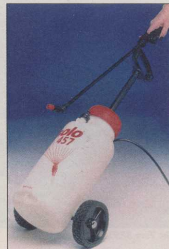
Roll with the Solo Rollabout Rollabout.

ing wherever the sprayer is needed. No screws, holes or fasteners are needed. The Rollabout Sprayer weighs 7.5 pounds, is 22 inches high and measures 11 inches hub to hub. The unit comes with standard inflation valve, wand, shut-off valve and nozzle and a six-foot hose. For more information, contact 757-245-4228.