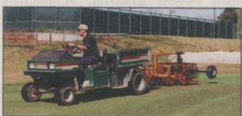
The SISIS frame on a Cushman Turf Truckster.

The new SISIS frame enables the quick attachment of SISIS implements to trucksters and other vehicles without 3-point linkage, utilizing the auxiliary hydraulics to raise and lower implements.