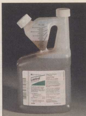
Dow's Lontrel herbicide.

Reward is also registered for use in aquatic areas such as along edges and nonflood areas of ponds, lakes, drainage ditches and canals. For more information, contact www.zenecaprofprod.com