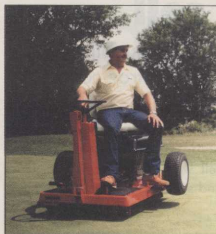
The Tournament Roller in action.

Smithco introduces the new and improved Tournament Roller greens roller. It features a more powerful en-