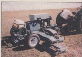
The pull-behind 5-gang.