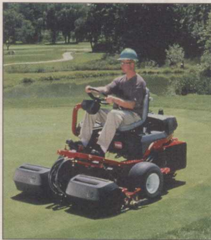
The Toro 3250-D