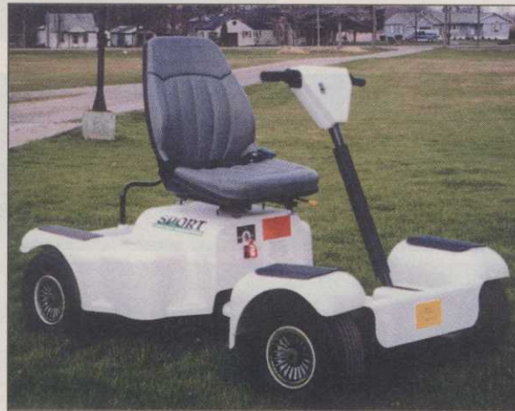
The Solo Sport.

For golfers with physical disabilities, the path to the fairway is often rough. With that in mind, Mobility Solutions, Inc. has created a unique vehicle to assist the disabled in their game of golf. The "Sport" is powered by twin 400 watt permanent electric motors, uses twin direct drive 30-to-1 reduction sealed gearboxes and a twist-grip stepless control throttle for smooth operation. The "Sport" can climb hills with a 1-to-3 gradient, has an attached electromagnetic parking brake for safety and uses a 10-amp, 24-volt automatic battery