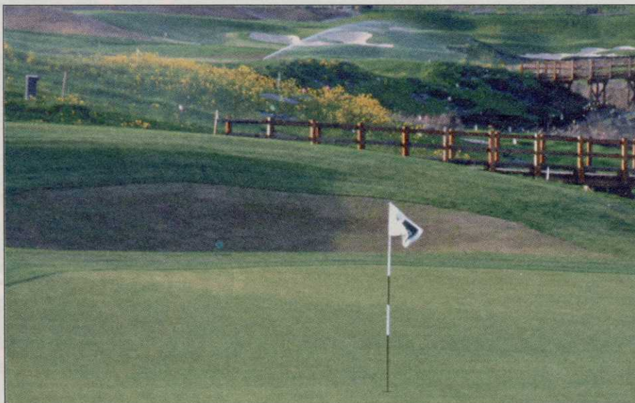
The 17th hole at The Bridges at Gale Ranch in San Ramon, Calif.