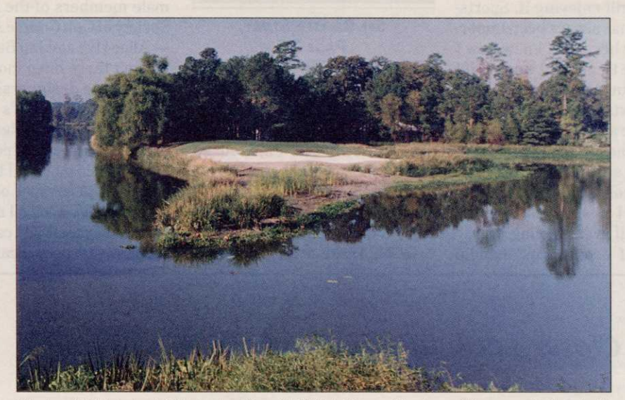
The par-3 15th hole at Whispering Pines Golf Club plays with a prevailing crosswind and will stretch from a gentle 96 yards to 178 yards from the back tee.

plete the job, not including the work currently under construction at the practice range. The remodeled practice range includes a new 10,000-square-foot putting green, 5,000-square-foot chipping green, 30-station tee line; two new grass tees and target greens.