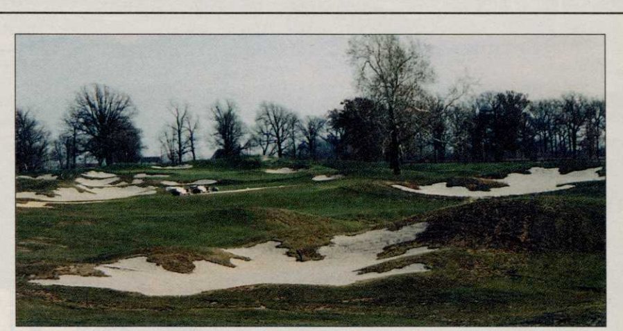
PURGATORY GOLF CLUB... IT'S OUT OF THIS WORLD Purgatory Golf Club in Noblesville, Ind., designed by Ron Kern, is nearing completion in this Indianapolis suburb, and opening day is targeted for late spring. See story, page 36.