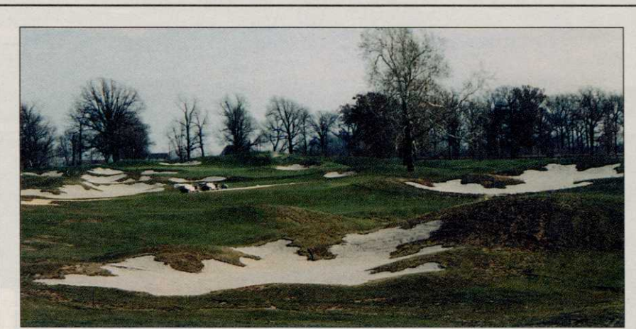
PURGATORY GOLF CLUB... IT'S OUT OF THIS WORLD

Purgatory Golf Club in Noblesville, Ind., designed by Ron Kern, is nearing completion in this Indianapolis suburb, and opening day is targeted for late spring. See story, page 36.