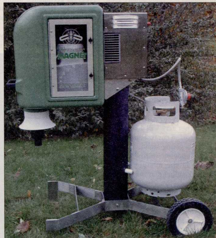
The Mosquito Magnet, which is about the size of a barbecue grill, converts propane to CO 2 to attract and trap biting insects.