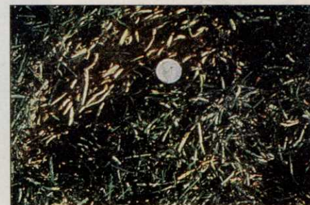
New low-mow Kentucky bluegrass plus perennial ryegrass excel on tees, fairways and roughs.