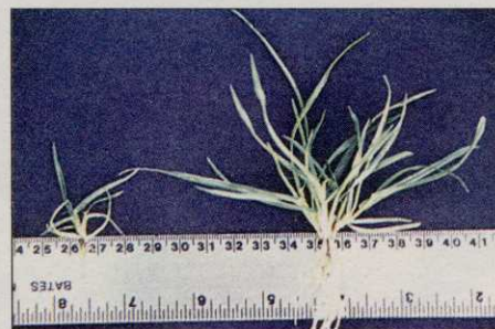
Relative size of Kentucky bluegrass and perennial ryegrass after six weeks.

Combining Kentucky bluegrass and perennial ryegrass can provide a versatile, high-performance turfgrass for golf course tees, fairways and roughs in cool-season grass areas, proving to be a quick-establishing, persistent, resilient and versatile playing surface.