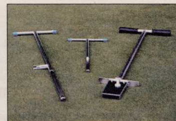
The full line of AMS turf testers.

Watch your mail for your registration form or call (401)848-0004 or visit us online at www.NERTF.org