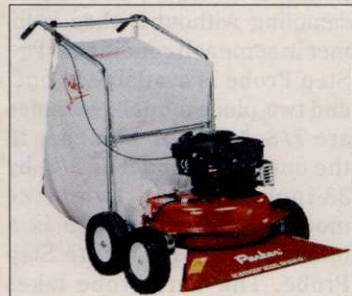
Minuteman Parker's Scavenger.

For more information, contact 800-323-2448 or www.dicksonweb.com .