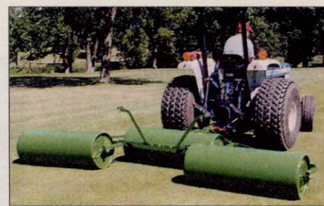
Gandy Gang Rollers.

Gandy Co. now offers gang rollers in 6- and 12-foot widths. The gang rollers feature three 18- by 24-inch rollers for the 6-foot model and three 18- by 48-inch rollers for the 12-foot model. Water-filled weights are 923 pounds for the 6-foot and 1,766 pounds for the 12-foot. The independent suspension hitch design allows each roller to follow the contour of the ground and permits backing of the gang roller. The 6-foot model can be converted to a spiker