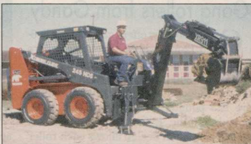
The Thomas XR911.

The Thomas XR911 xtreme reach provides two backhoes in one. Retracted, the XR911 provides all the advantages of a 9-foot backhoe with high breakout to ensure top productivity. A foot pedal on the operator's platform shoots the dipper out another 2 feet, turning the XR911 into an 11-foot backhoe. The XR911 features two-lever control and outrigger type stabilizers to provide stability. It also comes