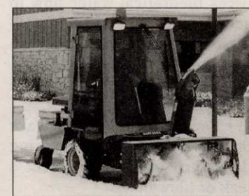
The Hustler snow thrower.

Vista's screen images, base irrigation program and flow balancing are accurate because they are created directly from the irrigation designer's Auto CAD plan. The program can be fine-tuned to meet course-specific micro climate and soil conditions. As adjustments are made, Vista calculates a new schedule using its dynamic flow balancing utility for optimum pump and system efficiency. Vista is based on Internet Explorer. For more information, contact 800-248-6561, or www.huntergolf.com .