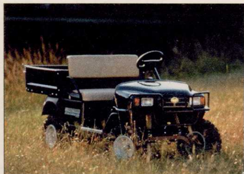
The ST Sport is powered by an 11-hp engine.

Additional features include a tubular steel front bumper with brush guards, a welded high-strength tubular steel chassis with a flexible impact-resistant front cowl, a heavy-duty bed liner with tailgate cover, a 6-gallon tank with fuel gauge, dual rear-wheel self-adjusting brakes, an automatic parking brake release with self-compensating system, a reverse warning indicator and a dash-mounted key switch. For more information, contact www.ezgo.com .