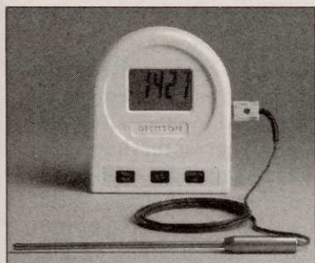
The Dickson SM 150.