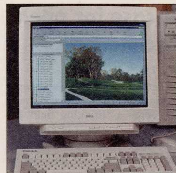
Hunter's Vista system is reality driven.