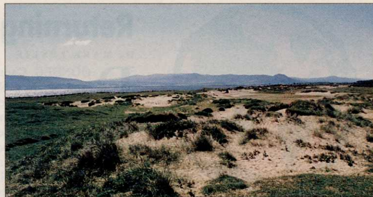
Dornoch Firth is in full view from the 10th and 11th holes of the 'Struie' course.

When someone suggests you spend more money on a less effective preemergent, it's time to hold on to your wallet.