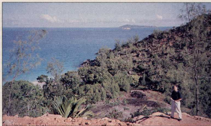
Rodney Wright stands on the elevated tee of the par-3 15th hole at Lemuria Resort on Praslin Island in the Seychelles.

Lemuria's front nine is scheduled to open in July and the full 18 is due to open in September.