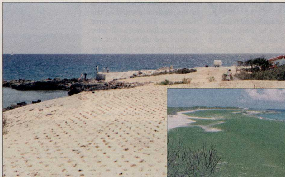
Greg Noman-designed Grand Exuma's 15th hole is complete (inset), while crews work to finish the rest.