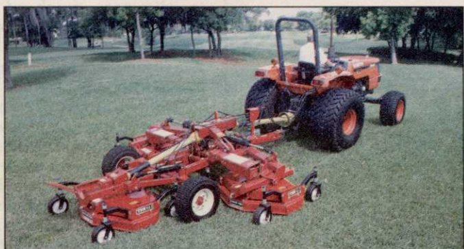
TDM-11 Mulch Pro Mower