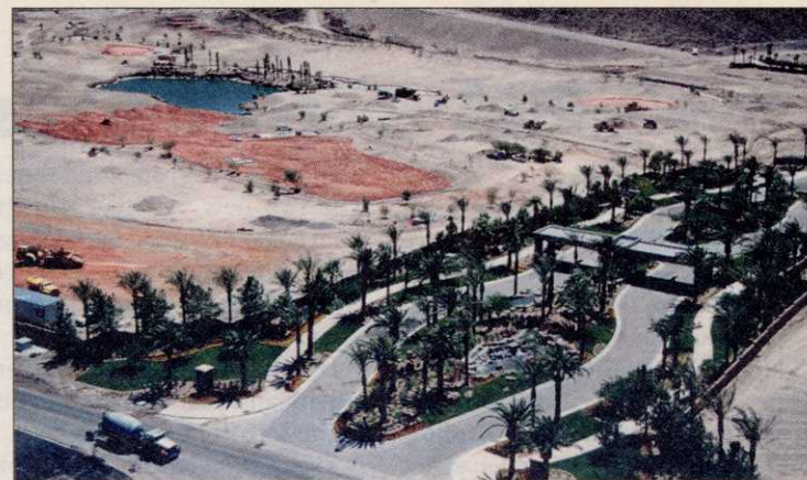
The MacDonald Ranch Country Club entry and golf course are shown in this aerial shot. The course is expected to be completed this spring.

An elaborate water feature on the course comprises several streams meandering downward along the fairways, forming several waterfalls that flow into a two-acre lake. The water feature interacts with the 5th, 6th, 7th and 8th fairways and, in keeping with the developers' desire for water conservation, will continually re-circulate.