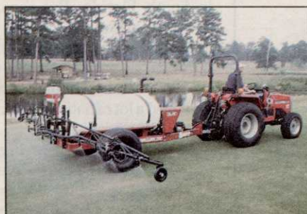
Pull Type Sprayer